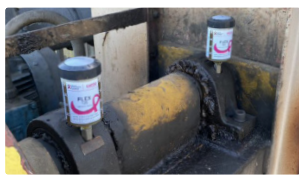
Duct extraction fan