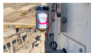
Conveyor pulley bearings and seals