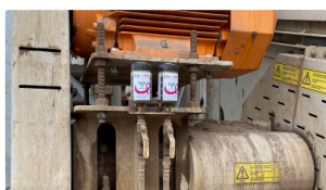
Drive shaft support bearings

perma FLEX is suited to a broad range of bearing applications and can also be filled with oil for the purpose of chain lubrication. The dial activation system is simple to use and allows the time setting to be adjusted during operation if necessary. perma FLEX is IP68 rated, meaning that it is dust tight and water proof and certified as intrinsically safe.