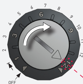
Rotary switch for discharge period setting

Dimensions perma FLEX 60: Ø 60 x 86 mm perma FLEX 125: Ø 60 x 116 mm